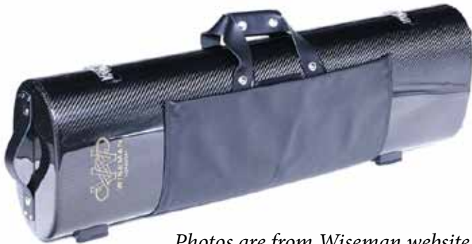
Photos are from Wiseman website.