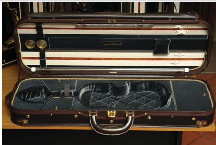
MUSAFIA MASTER SERIES

Every Musafia case sold by Borman Violins is made to order. Ranging from the entry level Lievissima cases to the top of the line Enigma series, with numerous customization options, there is a Musafia case for every performer and price point. Visit bormanviolins.com/cases.html for more information or email shar@bormanviolins.com for a price quote on your custom Musafia case.